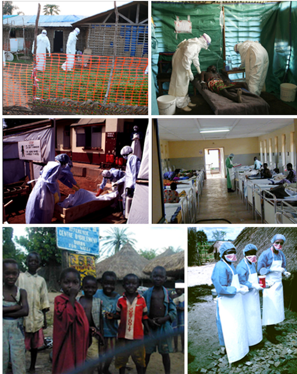
Fig. 2. Isolation wards for patients with filoviral hemorrhagic fever (EHF). Clinical research on FHF in sub-Saharan Africa would most likely take place in isolation wards established during the course of outbreaks. The infrastructure and equipment available at these sites may vary drastically. Although virtually all are “make-shift” in response to an outbreak, some wards are set up in pre-existing hospitals and may benefit from other services available at the site, while others are situated in local health clinics or rapidly constructed de novo in remote areas and offer little in the way of modern medical care. Some examples are shown. Top row: exterior and interior of the EHF isolation ward, Kampungu, Democratic Republic of the Congo (DRC), 2007 (Courtesy of Médecins Sans Frontières, Belgium). Middle row: EHF isolation ward, Gulu Regional Hospital, Gulu, Uganda, 2000. Left: workers remove the body of a victim from the isolation ward. Right: interior of the ward (Photos by Daniel G. Bausch). Bottom row: Marburg hemorrhagic fever, Durba, DRC, 1998. Left: children cluster outside an isolation unit in the local health center. Right: workers in protective garb prepare to enter the ward (Photos by Daniel G. Bausch).

Standard control measures for the filoviruses call for hospitalization of patients in an isolation ward (CDC/WHO, 1998; Bausch, 2006) (Fig. 2). This is the setting where future clinical research would logically take place. Ironically, in addition to the